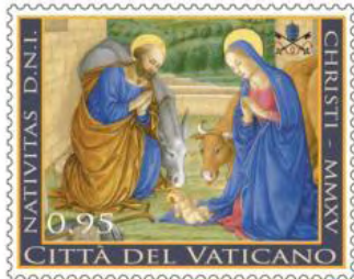
Vatican Christmas Stamp 2015

( http://www.vaticanstate.va/content/vaticanstate/en/servizi/ufficio-filatelico-e-numismatico/emissioni-filateliche/ultime-emissioni/natale-2015.html )